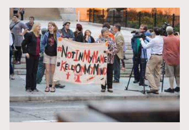
Candler School of Theology