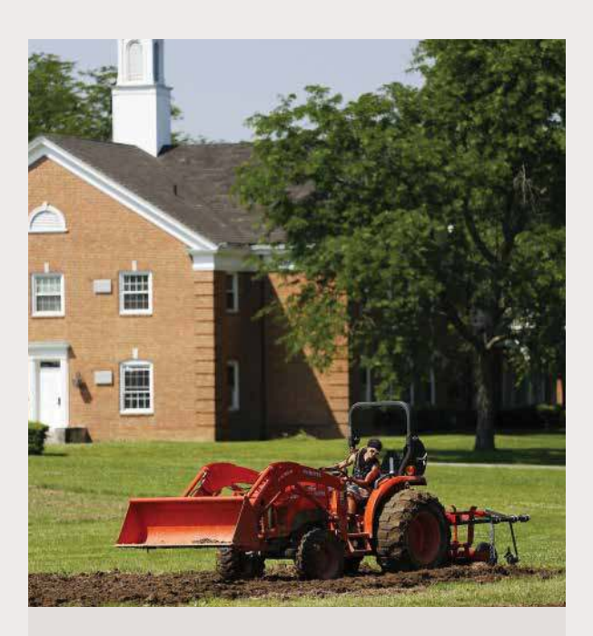
Methodist Theological School in Ohio

Ecology and Social Justice is offered as a standalone specialization for a master's degree in Practical Theology, or may be taken as a specific focus for Master of Divinity students. The current faculty is offering increasing numbers of courses on ecology issues, and a new faculty position in "Theology, Ecology and Race" will begin in 2017. The farm serves as a potential internship site for students, and many classes take part in the fieldwork.