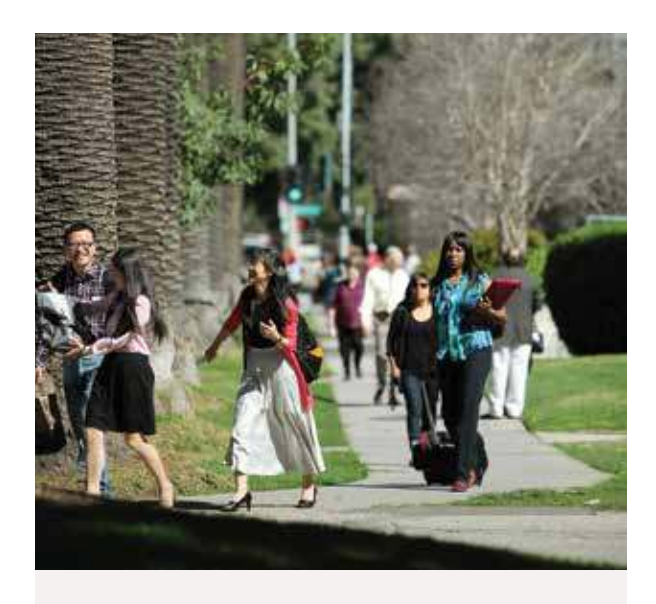
Fuller Theological Seminary campus