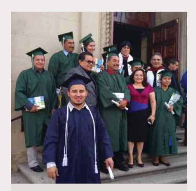
Group of graduates of the 2016 class at the Hispanic Center of Theological Studies, in Compton-CA. CHET (for its name in Spanish) is one of the institutions already certified by AETH.

The Association seeks to promote and enhance Hispanic Bible institutes, Bible colleges and seminaries by supporting educational programs, providing theological resources in Spanish and English, channeling opportunities for cooperation and communication between schools, fostering spiritual, professional, and institutional development among its members, and by working towards greater enrollment of Hispanics in these institutions. AETH understands theological education as a continuum between the local congregation, the Bible institute, and the seminary.