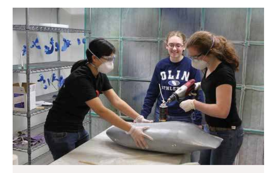
Olin College of Engineering students