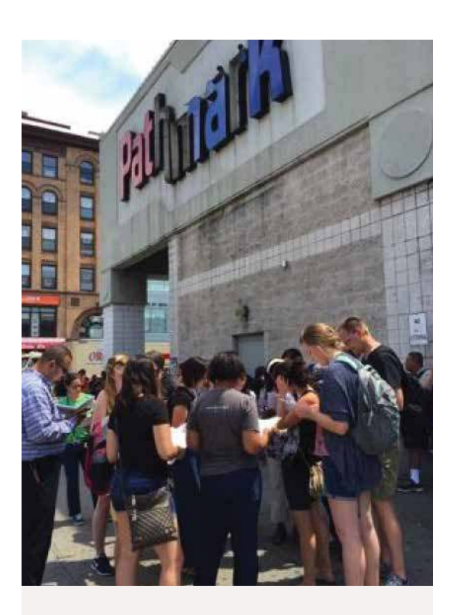
Pray and break bread. New York City